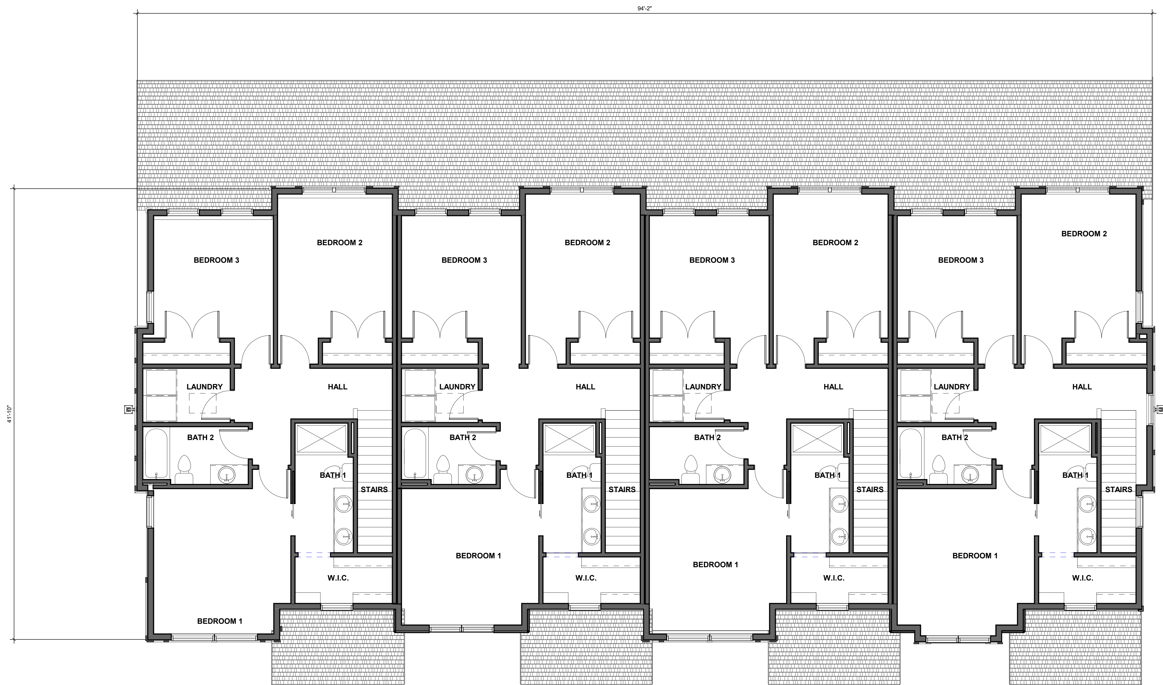
1 2ND FLOOR MARKETING SCALE: 1/4" = 1'-0"