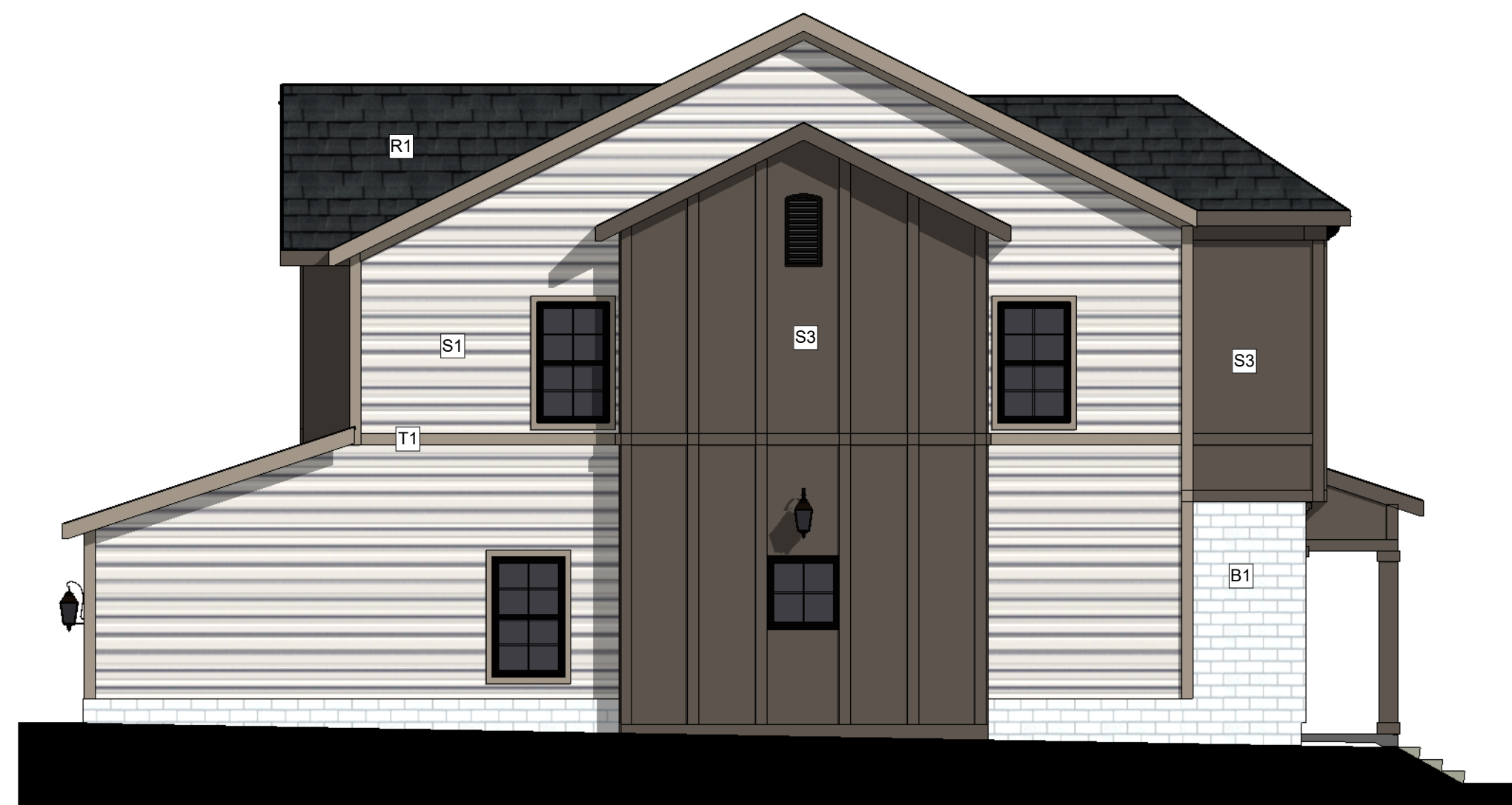
1 RIGHT ELEVATION SCALE: 3/16" = 1'-0"