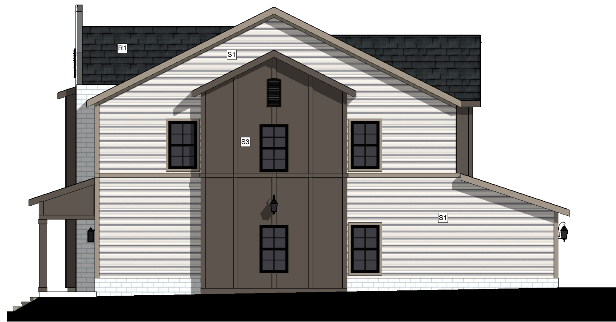
4 LEFT ELEVATION SCALE: 3/16" = 1'-0"