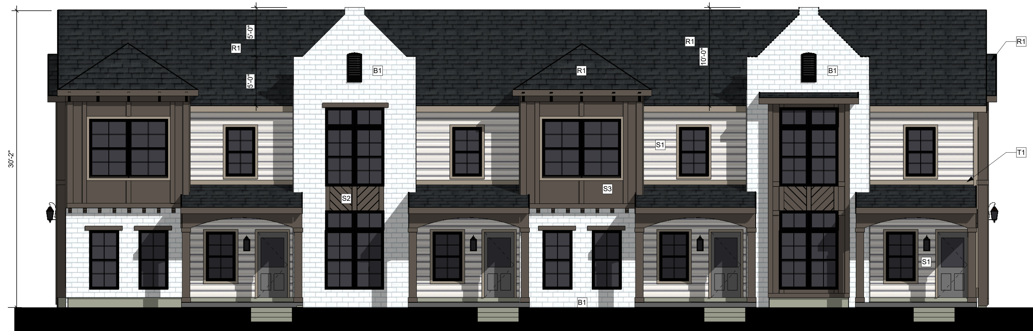
3 FRONT ELEVATION SCALE: 3/16" = 1'-0"